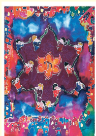
L'chayim