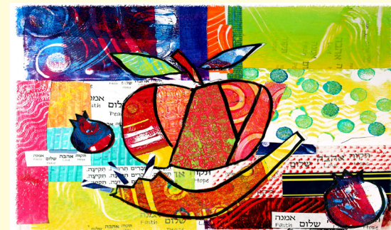
Apples Pom and Shofar © Michele Pulver Feldman

Don't miss your chance to JOIN THE BEST 2020/5781 FUND RAISING PROGRAM