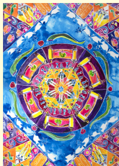
Holiday Kaleidoscope © Michele Pulver Feldman