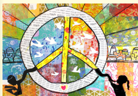
Signs of Peace